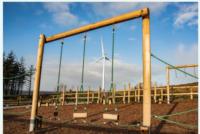
The Fund could help to build a playground