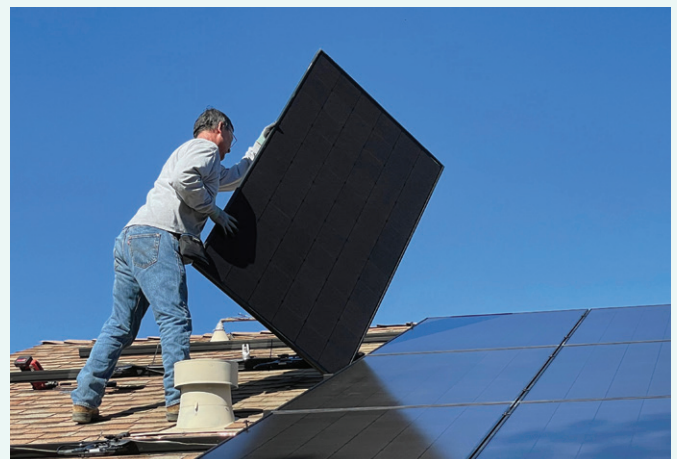
Home retrofit schemes fall under the remit