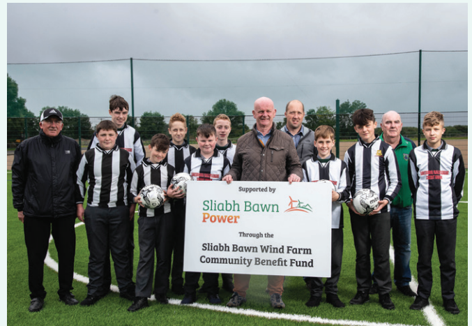
A Community Benefit Fund supports local clubs

For the residents around Scart Mountain and the adjacent hinterland, these funds will offer huge opportunities for strategic projects such as building local community facilities, deep retrofit schemes for homes or tourism upgrades and attractions. The scope for a community vision backed by reliable funding can help make rural regeneration a reality. For more details on RESS funds, please